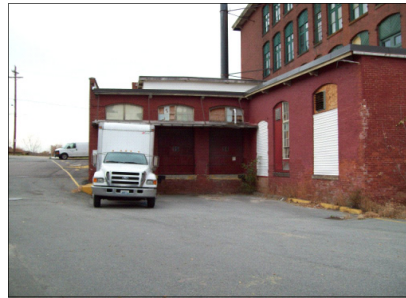
A view of the Hanora Spinning Mills Boiler Room

AEG was contracted to provide investigation and remediation of a #6 fuel oil spill below a mill building along the Blackstone River in Woonsocket, RI. When the extents of the release were identified, a RIDEM approved remediation system was installed in 2007 to remove oil from the groundwater. During the past 15 months of operation, over 4,600 gallons of oil has been recovered and has been used to heat the building, thus reducing waste disposal costs.