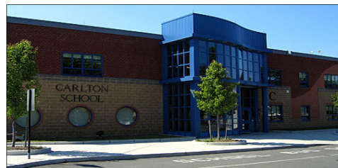
View of the new Carlton School Building

During construction at the Carlton School in Salem, Massachusetts a black, oily waste was encountered. AEG identified contamination at the Site and reported the Site to the MADEP on behalf of the City. AEG implemented an Immediate Response Action Plan and a Health and Safety Plan and oversaw the excavation and disposal of contaminated soil. AEG monitored Site activities and worked to eliminate environmental hazards. AEG closed the Site with an RAO in accordance with the Massachusetts Contingency Plan.